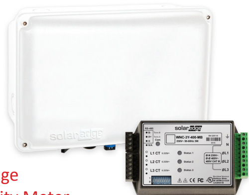
SolarEdge Electricity Meter

Vampires are the small devices constantly drawing power throughout the day. Individually, they don't seem like much but their usage over time can add up. Hogs are the heavy energy users like air conditioners, pool pumps, heaters and ovens. With the SolarEdge Electricity Meter, find out how much your total energy use is costing you every month, make a few changes, and start saving money!